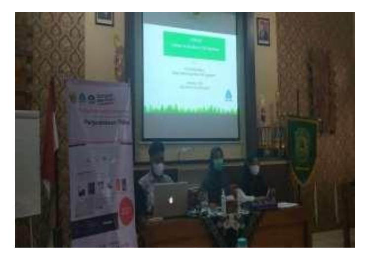
Figure 3. Presentation of LVEP literacy material to the TPA Cadres

The third session, delivery of material on the concept of LVEP and literacy in the handling of stunting through the LVEP strategy. The material was delivered by An-Nisa Apriani, M.Pd. The delivery of the material aims to give participants a broader understanding of stunting handling through the LVEP strategy.