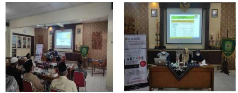
Figure 2. Presentation of Al-Quran literacy material to the TPA Cadres

On the second day, the introduction to Tajweed and practiced in reading selected verses, namely: QS. Al Baqarah: 255, 284-285, Ali Imran: 133-136, Al Mu'minun: 1-11, and Al Luqman:12-15. The goal is that when you become an Imam , you will be able to read the readings in prayer smoothly because the mentor reads directly in front of the participants. The next session was an introduction to the basics of dinul Islam which included the pillars of faith, the pillars of Islam, Asmaul Husna , and the story of the Prophet Ulul Azmi . In the last session, the training materials were in the form of local content and self-development in the form of practices of Hadrah , Qasidah , Nasyid , Self-Defense, and Foreign Languages (English and Arabic).