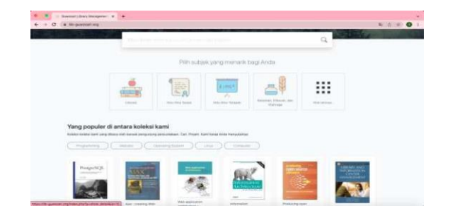
Figure 4. Homepage

Figure. 5 shows Shows detailed information on digital literacy collections. This information displays the biodata/identity of the selected digital literacy. Identity includes series title, publisher, media type, isbn, brief description of literacy, and other variables.